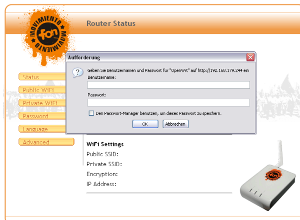
Abbildung 2: Username and password

9. You will be asked for an username and password. This is both „admin“ by default.